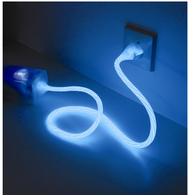
Figure 1. The ‘Power-Aware Cord’ from the Interactive Institute, Sweden. The product is designed to visualize, rather than hide, the energy that appliances use, thereby causing people to reflect on how their behavior impacts the environment.