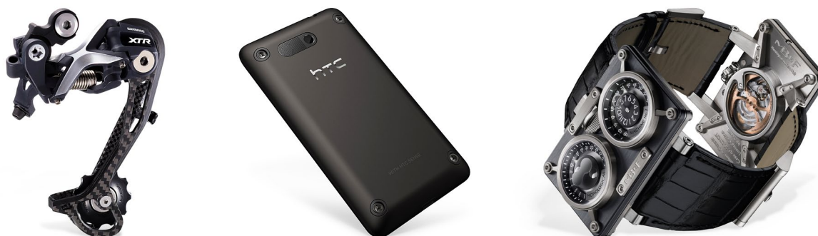
Figure 2. The selection and presentation of fasteners can result from and be attributed to technical, informative or persuasive intentions or from some combination of these. From left to right: Shimano 'XTR derailleur' (bicycle component) © Shimano Inc.; 'HD Mini' (mobile device) © HTC Corp.; 'Horological Machine N°2' (wrist-watch) © MB&F.

The idea that users infer the persuasive intentions of designers presupposes that users recognise that products are designed and also presupposes that users have an image of a design process that allows for persuasive intentions to shape the product. These suppositions point to a much more general question: what knowledge of design do users possess? Questions about the inference of persuasive intentions must therefore be considered with respect to this broader question, but the focus here remains on persuasion rather than the many other types of intention or constraint that users might believe that a product results from, including technical, organisational and legislative factors. This is because existing work on persuasion knowledge offers well-developed theories and empirical results to build on and because the effects of persuasive intentions are of growing interest in technology and design research (Fogg, 2002; Fogg, Cuellar, & Danielson, 2003; also see proceedings from the Persuasive conference series, e.g. Ploug, Hasle, & Oinas-Kukkonen, 2010). Work on persuasion knowledge suggests that users will infer persuasive intentions, but research on persuasive design and technology has so far not attended to this. Focussing on the inference of persuasive intentions is thus warranted and timely, but many of the issues this raises apply to broader ideas about users' knowledge of design, an encompassing phenomenon about which very little is known.