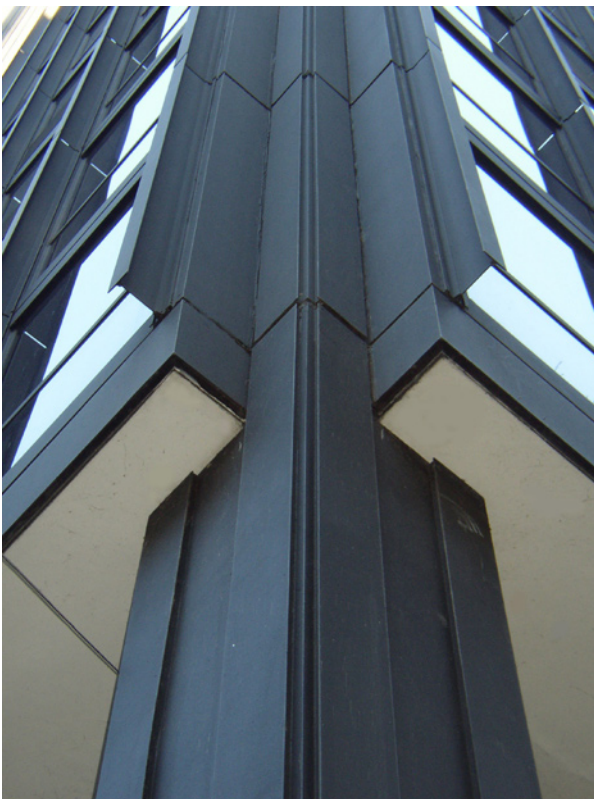
Figure 6. Lake Shore Drive Apartments, Chicago, Illinois, 1948-51, by Mies van der Rohe. View of the corner façade based on simple but not simplistic details.

is needed to study the contribution of this cognitive strategy to design problem-solving and design practice in general and to design creativity and design education in particular.