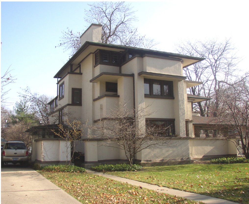
Figure 4. William Martin House, Oak Park, Illinois, 1909, by F. L. Wright. Vertical interlocking of rectangular masses containing different functions makes a striking composition.