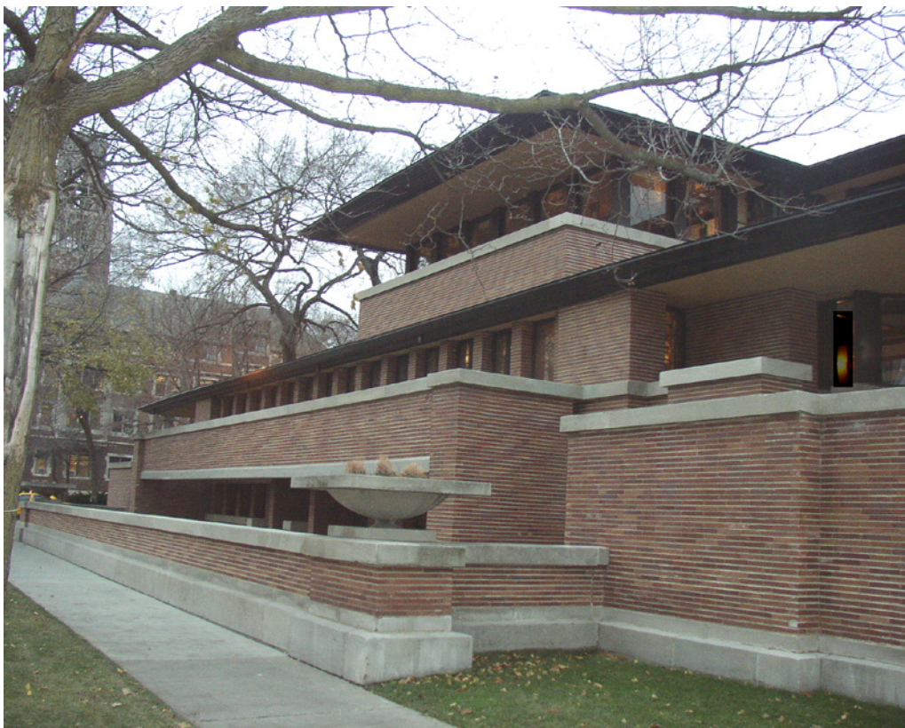
Figure 2. Frederick C. Robie House, Chicago, Illinois, 1906-1909, by F. L. Wright. External form as an outcome of internal use.