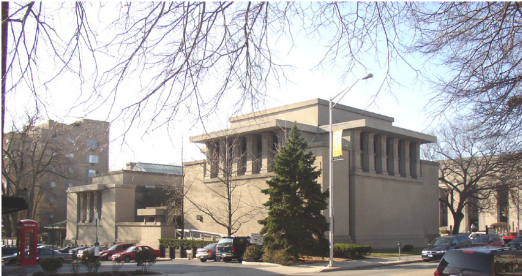
Figure 1. Unity Temple, Oak Park, Illinois, 1904-1907, by F. L. Wright. External form reflects the idea of a fortress protecting the sanctuary from external noise.