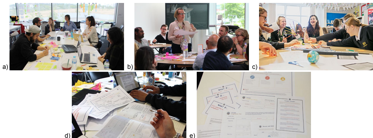
Figure 2. The photos in the case study: a) The design project team in their studio; b) Pilot project careers leaders in workshop 4; c) Pupils, staff and the design team during workshop 3; d) Development of the work investigations framework resources; e) Examples of the work investigations framework resources.