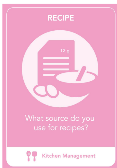
Figure 4. Revised design of a topic card, with the category name in contrast.