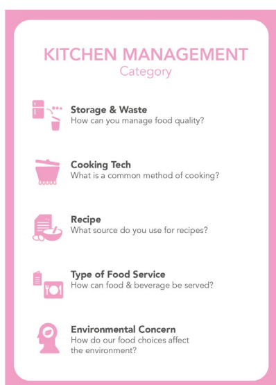
Figure 3. Example of a category overview card, showing the five topics in the category kitchen management.

The assignment was performed by 11 groups of 3-5 students, each composed of 1-3 design students and 1-2 non-designer friends. They started the session by choosing two games they wanted to play. They could also invent an additional game themselves.