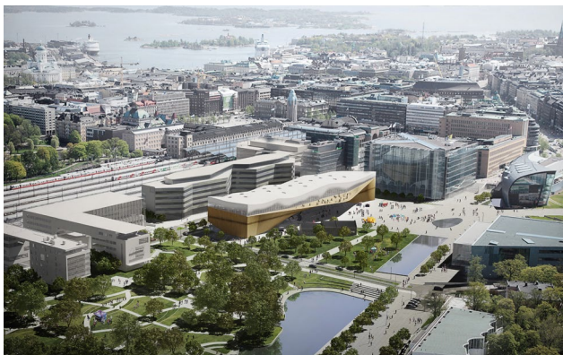
Figure 1. An aerial overview of CeLib and key space reservations. Image: ALA Architects and Helsinki City Library—reprinted with permission.

Finnish libraries are part of a global transformation where, instead of being just access points for books and other cultural productions, libraries offer alternative co-working spaces, serve as community centers, arrange activities and events with partners, provide means for new forms of cultural and digital production and act as hosts to democratic engagements and citizens' initiatives (Dalsgaard, 2012; Hyysalo & Hyysalo, 2018). CeLib will spearhead this transformation. It is to serve as a sort of town square where social cohesion and democracy come to life. Each of its three floors is built to fulfill a different civic purpose. Its expansive ground floor includes, for instance, a restaurant, movie theater and several areas suited for activities and events and is meant for happenings, mingling, and discovery. The second floor is for noisy creative activity featuring creative space, music studios, game and visual studios, digital learning areas, various digital equipment and co-working spaces. The top floor features a brightly lit "book heaven" and playful children and family area for more conventional space for reading stories, relaxing and concentrating. The design is also transformable to accommodate new functions as the users' needs are likely to change in the future.