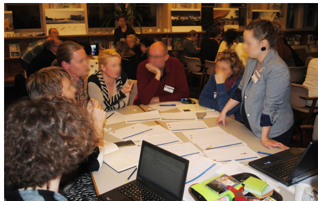
Figure 5. Group ideation and discussion in one of the FCL subgroups.

the scheduling, and the expedited workshop worked well. The ideas gathered from each group were many and of high quality and required only little polishing and clarification before being used to feed forward to the next workshop and to CeLib main planners. After the event there was an excited atmosphere among the participants and jubilation amongst the project team as FCL had started on the right foot.