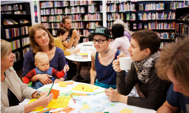
Figure 4. One of the campaign images for FCL portraying the collaborative design work.

FCL community. Applications featured good diversity, with slight bias to higher education, middle age and women. Unsurprisingly, there were fewer applications from young people and citizens with an immigrant background—the two most difficult-to-reach customer segments for the city library. But it was a very good yield, nonetheless.