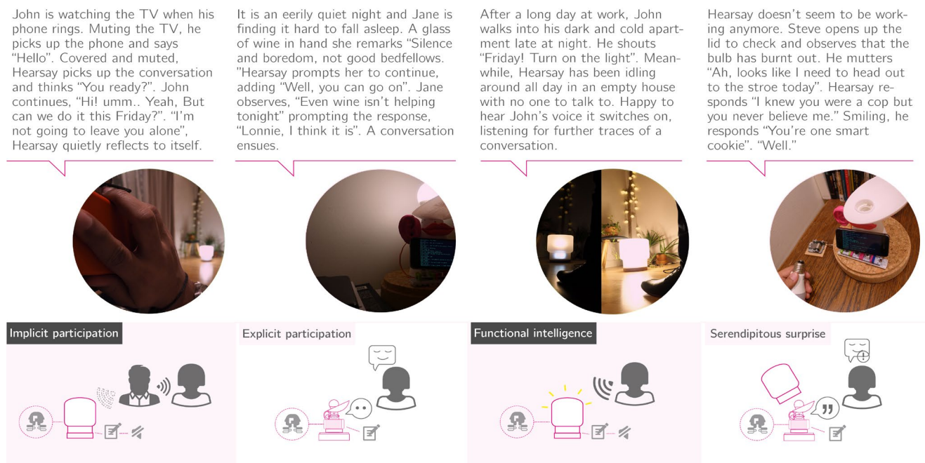
Figure 2. Hearsay in possible scenarios/narratives of use. Top: examples of real responses from the artefact.

The uncovered state physically amplifies the connected material form that Hearsay makes available—the captured conversations and their generated responses. These are displayed in a small screen, on the artefact . Captured conversations are not deleted, and so the user can explore them using a physical control on