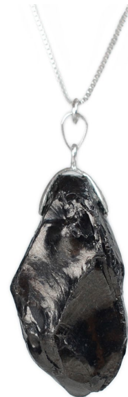
Figure 6. Crater : a pendant necklace.

In our process, we sought ways of using the imagery of coal to bring about positive memories of Karen's father, resulting in Crater (see Figure 6). We were cautious to avoid the common associations of coal as dirty and instead aimed to treat the material as precious, using a piece of anthracite coal much like a gemstone. We saw the coupling of coal with worn jewellery as an ideal way of reflecting the significance and closeness of Karen's relationship with her father. The coal piece also invited further engagement through its tactility, containing smoothed edges that fit within a person's hand.