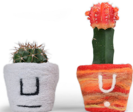
Figure 7. Dyad : a set of pot plants.