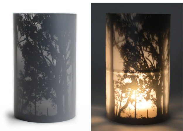
Figure 4. Diramu: a candle cover.