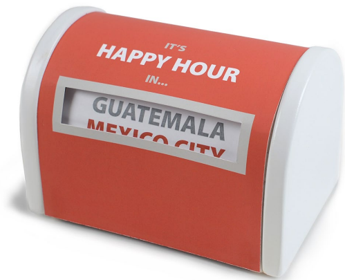
Figure 2. Globe: a world clock.

Louise’s rich experiences of growing up in rural Australia “surrounded by bush” were a central theme of the stories she shared. Australian native bushlands reflect both her past identity and anticipated future identity beyond retirement as she looks forward to one day returning to a “more simple” rural lifestyle. We drew inspiration from her rich recount of bushfires approaching her family home before being doused by her parents and the local fire department: “I have these really vivid memories of trees, full trees, being on fire.” This imagery was used in the design process of Diramu , a scented candle with a transparent cover sleeve (see Figure 4). We used a smoky, campfire scented candle in conjunction with silhouettes of native Australian trees to create a sensorial experience of a flickering light and scent reminiscent of Louise’s vivid childhood memories. A candle was used for the calming effects of its gentle scent and soft lighting, pairing back the intensity of the bushfire imagery and reflecting Louise’s future anticipations of leading a less stressful lifestyle amongst bushlands.