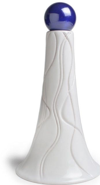
Figure 3. Kiruna: a decanter.