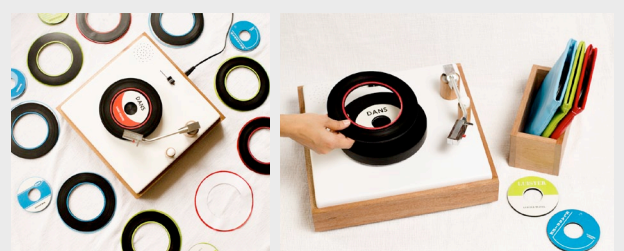
(Reprinted with permission.)

Some designs focus on a specific emotion. Owusu (2012) found in the research for her graduation project at TU Delft that people with dementia rarely experience pride. With this in mind, she designed a social, interactive activity: A turntable on which users (patients with dementia) playfully match record pieces so they can play music from their past. The activity has been shown to stimulate the recall of autobiographical memories, enrich social interaction, and evoke feelings of pride.