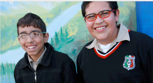
(Reprinted with permission.)

“See Better to Learn Better” is a Mexican government-supported initiative to provide Mexico’s children with free corrective eyewear. Proper eyesight is indispensable in a traditional classroom setting. However, in some areas in Mexico, every other school child is in need of corrective eyewear and therefore at risk of not performing well at school. The project seeks to change these children’s lives by enabling them to learn. A central component of the program are the eyeglasses themselves: The two-part frames are customizable (7 colours, 5 shapes, and 3 sizes), thereby increasing acceptance and making replacement of the glasses easy, while the hyper-flexible material safeguards durability. The success of the program might be facilitated by the specific design, which was carefully crafted for the context, but, in the end, it remains up to the children to make the most out of this new opportunity.