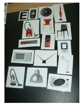
E: simple, sleek