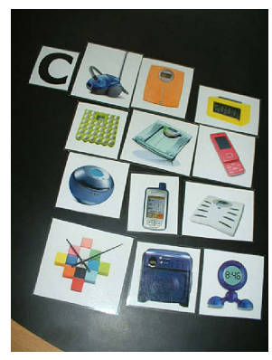
C: playful, colorful