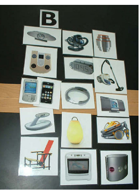
B: modern, futuristic