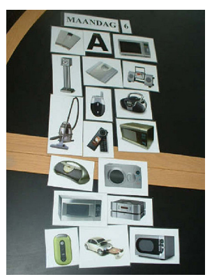
A: metallic, modern

The next step was to perform a Principal Components Analysis with a Varimax rotation to identify the underlying attributes of the appearance descriptions. The procedure was performed on a Product x Description frequency table in which each cell counted the number of times a certain product was described with a certain product description. This data proved suitable for factor analysis (Kaiser-Meyer-Olkin = 0.780 and