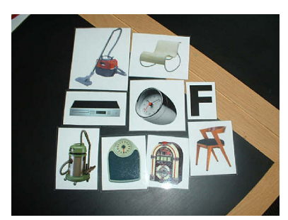
F: old-fashioned, plain