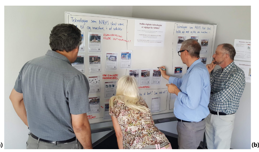
Figure 4. (a) A box of Technology Cards; (b) Participants in a Tech Session moving around enlarged Technology Cards.