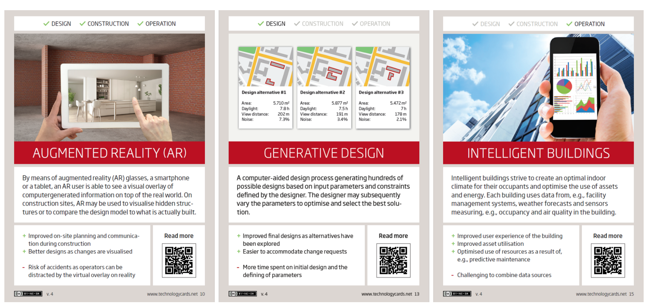
Figure 1. Three of the Technology Cards (www.technologycards.net).

shows the expected implications on a typical construction process, i.e., whether the technology contributes primarily to the design phase, construction phase, and/or operation phase of a typical construction project (Motawa et al., 1999). Users interested in obtaining additional information may use the QR code in the bottom right corner of a card to access to the webpage (www. technologycards.net), which contains detailed information on each technology. The Technology Cards present 22 technologies, which are listed alphabetically in Figure 2.