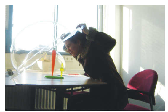
Figure 3. Participant in the see-and-smell-condition smelling a product.

For each product we compared expected odor identification responses in the see-condition to perceived odor identification