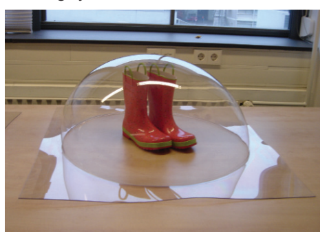
Figure 2. Stimulus presentation: products were placed under plastic domes.

Two groups of three products were created. Group A was comprised of two products in the WS category (lemons and wooden bowl) and one product in the NS category (boots). Group B was comprised of two products in the NS category (kitchen paper holder and decorative dice) and one product in the WS category (plant with flowers). The two groups of products were placed in separate rooms. The products were placed on tables, and plastic domes were placed over the products (Figure 2). By doing so, when participants entered the room they could see the products (visual information) but could not smell them (olfactory information) as the dome sealed in the odors. Rooms were ventilated thoroughly between trials.