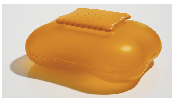
Figure 1. Mary Biscuit, biscuit box. Designed by Stefano Giovannoni, 1995; Producer: Alessi spa.