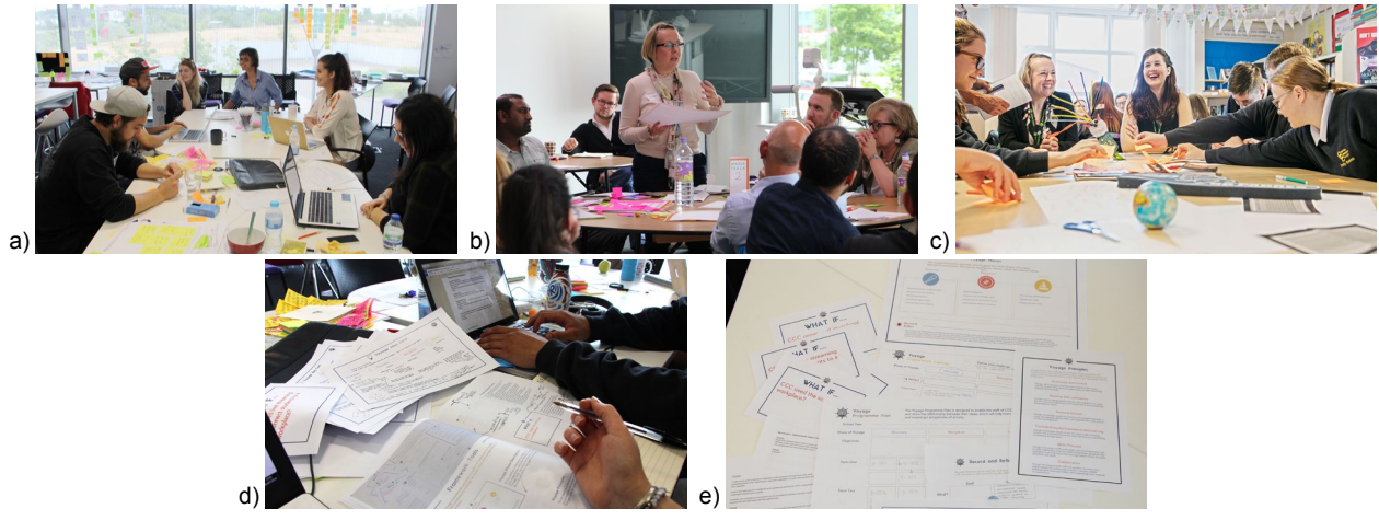
Figure 2. The photos in the case study: a) The design project team in their studio; b) Pilot project careers leaders in workshop 4; c) Pupils, staff and the design team during workshop 3; d) Development of the work investigations framework resources; d) Examples of the work investigations framework resources.