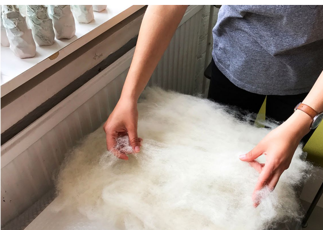
Figure 1. The setting of the first author's own studio and some wool type. Photography: Aktaş, May 2017, Finland.