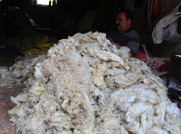
Figure 2. The setting of Ilyas's studio and the wool type he employs. August 2017, Tire, Turkey.