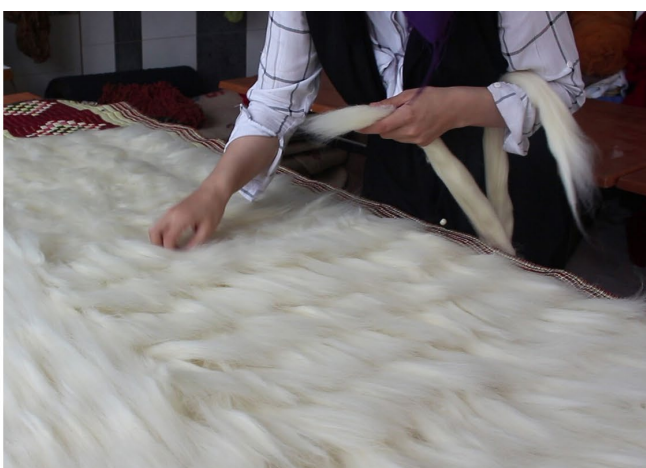
Figure 3. The setting of Gencer's studio and the wool type he employs. Photography: Aktaş, August 2017, Yalvaç, Turkey.