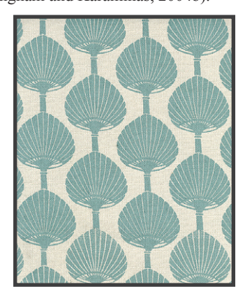
Figure 3. Japanese Fan. Courtesy Signature Prints: The Florence Broadhurst Collection.

The motifs that appear in The Broadhurst Collection comprise Nagoya (Peaches) (Figure 1), Chelsea (Chinese Chrysanthemums) (Figure 2), Japanese Fan (Figure 3), and Japanese Bamboo (Figure 4) designs, as well as Cranes (Figure 5), Exotic Birds (Figure 6), The Egrets (Figure 7), and Persian Birds (Figure 8). The choice of themes goes back to Central and Northern Asian symbolism and religious iconography, and in this sense its taxonomic, aesthetic structure is valued as 'different' and 'exotic' as opposed to the "Australian taste of décor at the time which tended to be flat in colour and conservative" (Broadhurst, as cited in Signature Prints, 2002b, p. 1)7. Thus, the designs themselves become negatively marked as objects of inspiration whose various "levels of meaning applied through social and historical relations cease[d] and [went] beyond and out of context of their original cultural significance" (Van de Ven, as cited in Clifton-Cunningham and Karaminas, 2004b).