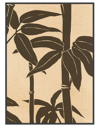
Figure 4. Japanese bamboo.

It cannot be denied that Broadhurst's designs were subjected to a repeat process of adaptation and manipulation, but it is equally undeniable that out of this procedure evolved an inspiration for Chinese and Japanese images that depicted a 'traditional, refined and ethereal East.' "The chrysanthemum that appears in the Chelsea (Figure 2) design," states Australian designer Akira Isogawa (personal communication, February 21,