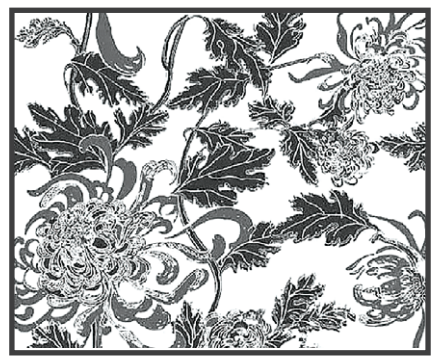
Figure 2. Chelsea.

textiles. He said, "It gives me a feeling of being somewhere else [like] the Far East, or somewhere exotic in another time" (personal communication, February 21, 2004).