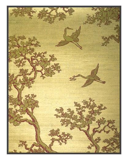
Figure 5. Cranes.

Cranes (Figure 5) and Exotic Birds (Figure 6), rather than the familiar chrysanthemum, were the emblems of the early Japanese sovereigns. The ancient court history describes their depiction on the banners of Emperor Mommu in the year 701, and as such they are the most explicit early examples of fixed designs used as a symbol of a person's status in Japan. The Scroll of the Mongol Invasion, a thirteenth-century pictorial account of battles, includes one of the most intricate of Japanese heraldic