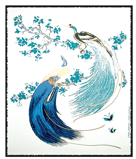
Figure 6. Exotic Birds.

crests, a circle enclosing the traditionally auspicious symbols for longevity, the crane , the bamboo (depicted in Figure 4), and the plum blossom. The crane symbolizes a thousand years of life. The plum blossom is a traditional symbol of fortitude in all of Asia for it "braves the lingering chill of winter to bloom before all the other flowers" (Dower, 1995, p. 15). Together with the bamboo, the plum blossom is known as one of the 'three companions of the cold.' The bamboo, a symbol of resiliency, was also associated with longevity in Chinese legends, which held that the phoenix (peacock), bird of immortality, dined on bamboo. In a sense, the above motifs utilized by Broadhurst have become objectified simulated, adapted, corrupted, and, ultimately, appropriated.