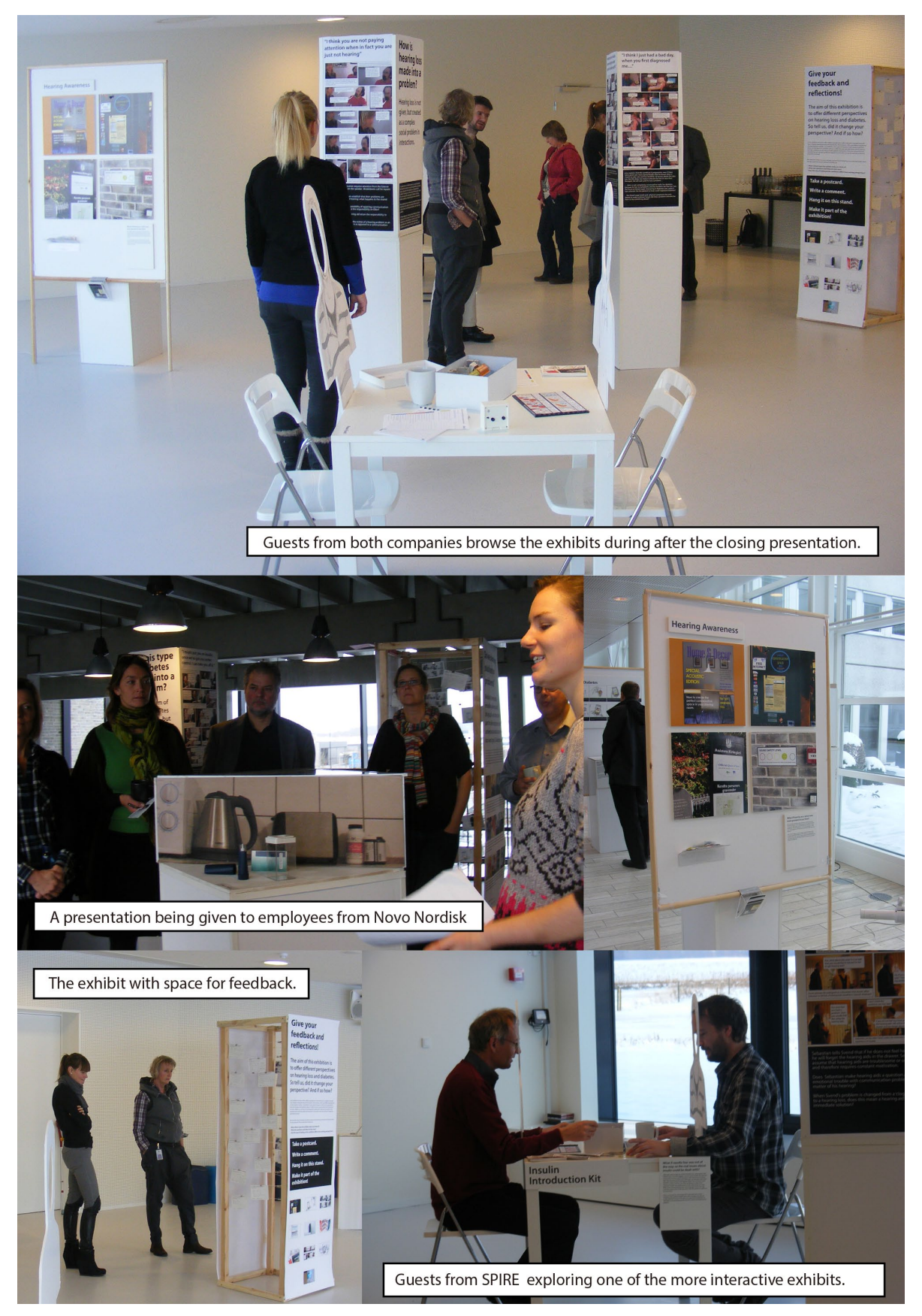
Figure 1. The exhibition in various locations.