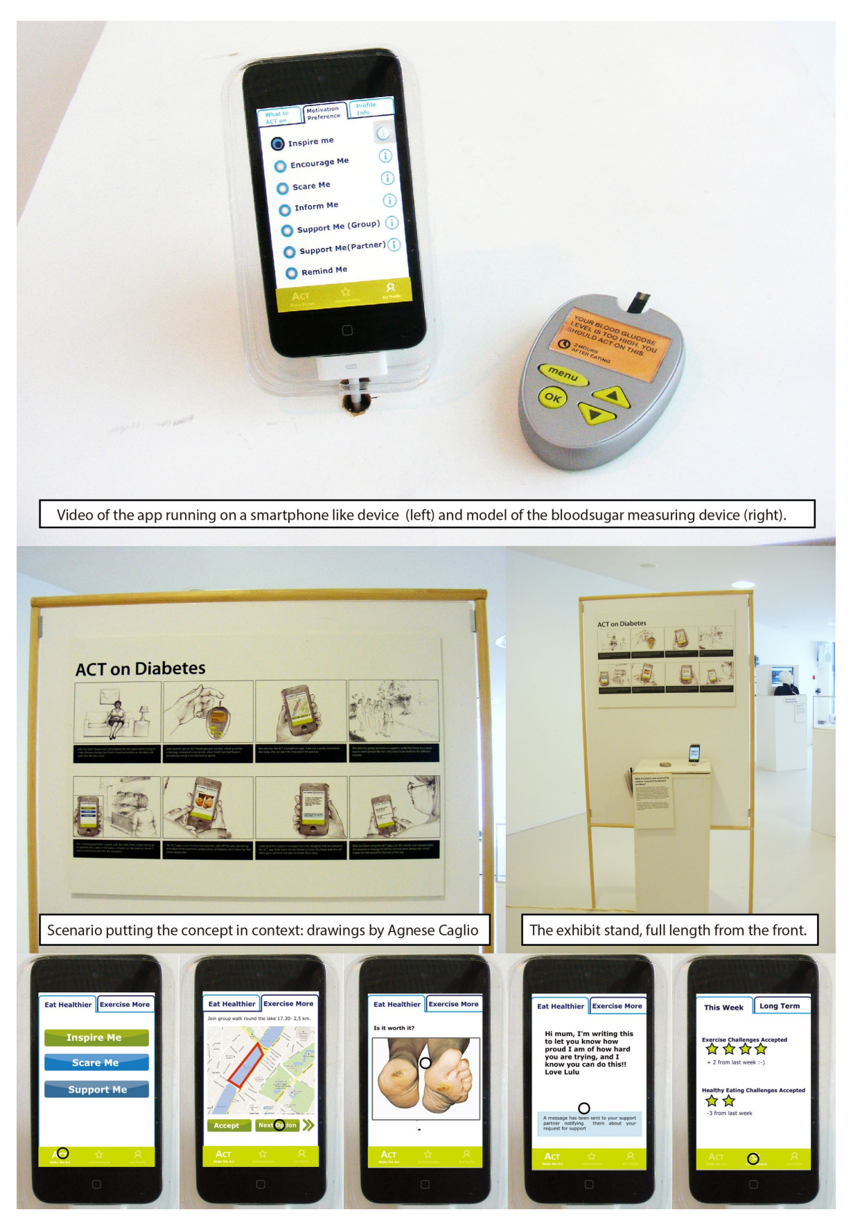
Figure 3. ACT on diabetes exhibit.