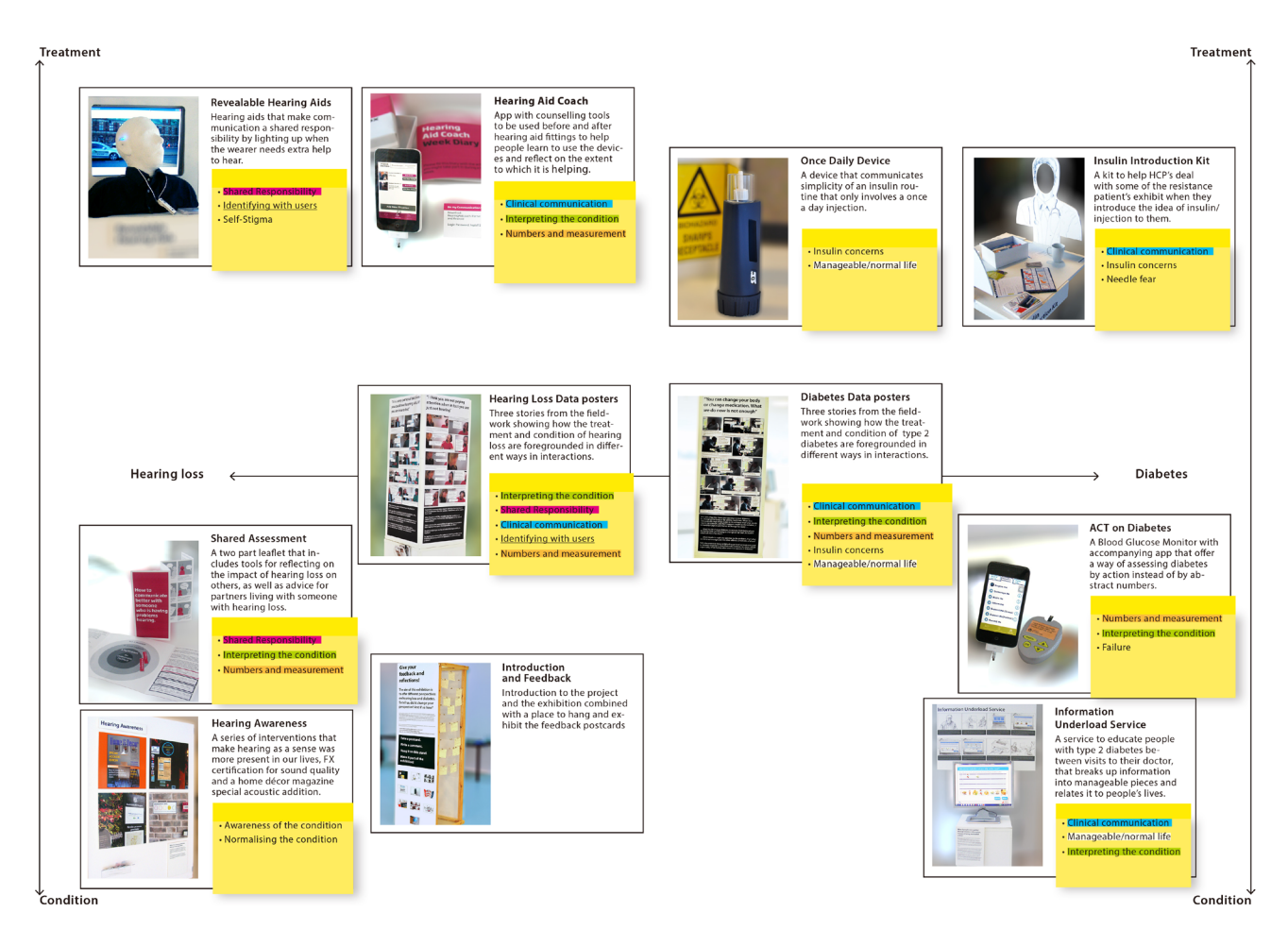
Figure 5. The collection of the eleven exhibits with their themes from the fieldwork.

Balance, diversity, and coherency were also central considerations in the physical design of the exhibition. Several different formats were used for the concepts. Generally there were two of each (two devices, two applications, two information kits, one service, one set of photographs). The space was laid out so there was no single way to walk through it, no path with a beginning and end, but rather an open landscape with the stand that offered a chance to give feedback in a central position. The format of the exhibits was also diverse and as balanced as possible (four were boards with small display podiums, two were larger podiums, two were installations set-up with furniture, and the feedback stand along with the two stories from the field stands